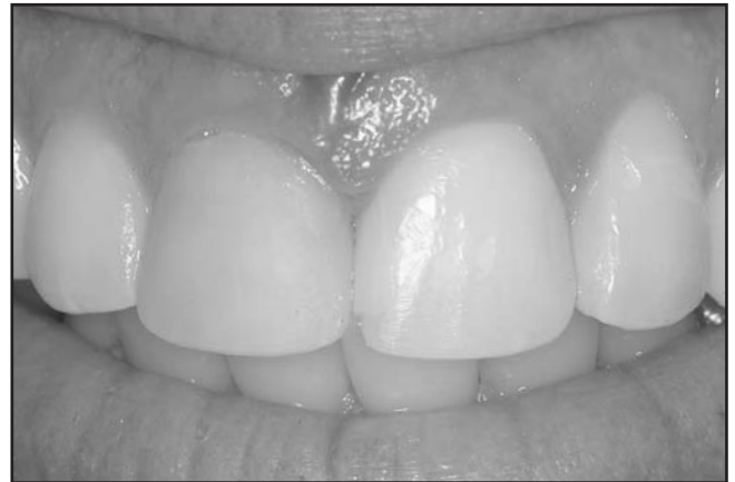
Figure 2. The low value is evident through the use of black and white photography.

The key element in shade selection is the clinician's ability to visualize the color and histological determinants of the natural dentition to be emulated, and then correlate them with the restorative resins. 7 The perceived color of a tooth is, in actuality, a combination of an inner substrate (ie, dentin) and an outer substrate (ie, enamel), and is also known as the composite tooth color. 8 Each bears