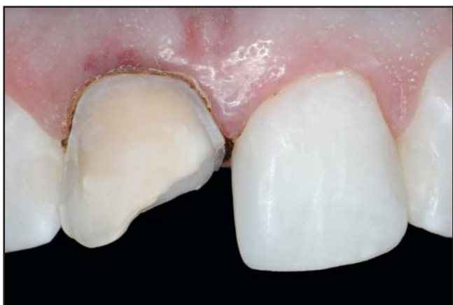
Figure 10. Postoperative view of the definitive restoration on tooth #9. Primary anatomy and the exact mesiodistal width are achieved.

retention between the existing composite and the new restoration of tooth #8. Sandblasting also removed the aprismatic enamel of the proximal, and partially labial and palatal aspects of tooth #9. 23 A 35% phosphoric acid was used for 15 seconds on enamel and rinsed off. After air-drying, a bonding agent was applied and light cured (Figures 9 and 10).