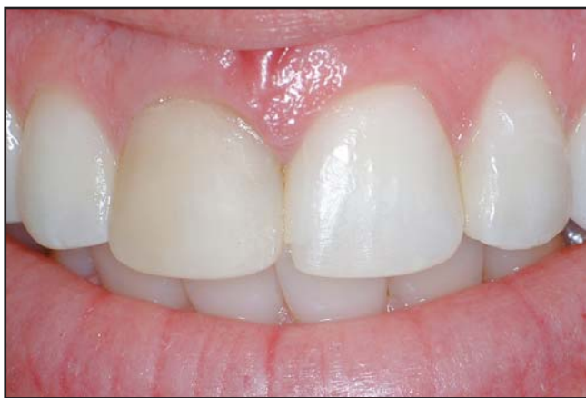
Figure 1. Postbleaching view of the smile depicting a defective Class IV/veneer composite restoration.

its intrinsic physical and optical properties that must be understood individually and collectively. Dentin is approximately 20% more opaque than enamel 9 and is responsible for providing most of the hue of a tooth, which falls in the red-yellow spectra. 10 Enamel is but a fiber optic layer that modulates the perception of the underlying dentin color. 11 The degree of translucency/opacity of enamel can vary according to natural factors such as thickness, genetics, and age as well as operative-induced factors such as tooth bleaching. 12 Such variances can determine one's perception of the underlying dentin color, thereby altering its chroma and value. Highly translucent enamel permits light to be transmitted through it to reach a deeper, high-chroma dentin substrate and reflects most of its hue without much change in color saturation. This circumstance provides an enamel of lower