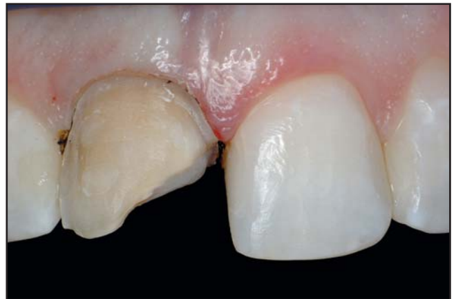
Figure 8. Class IV restoration/veneer preparation is completed, revealing a challenging situation both from a color and contour point of view.

to aid in the concealment of the tooth-composite transition 21 ; this would allow for the application of a greater thickness of composite with similar optical properties to the natural dentin. As the middle third of a central incisor would be subjected to the highest tensile stress upon function, 22 a 1-mm-long and 1-mm-thick chamfer was placed palatally, instead of a bevel, to allow for a thicker layer of composite at the tooth-restoration junction. In this author's opinion, this preparation concept might promote better marginal integrity and longevity.