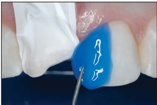
Figure 9. Teflon tape protects the adjacent tooth during acid etching. After air-drying, a bonding agent was applied and light cured.