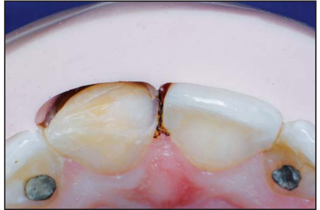
Figure 7. A PVS guide is created and used throughout veneer preparation to gauge amount of tooth reduction.

A putty polyvinylsiloxane (PVS) matrix was obtained from a previously waxed-up model in order to aid in the three-dimensional perception of the defect boundaries (ie, determination of incisal edge position), embrasure forms, and palatal anatomy (Figures 5 and 6). Similarly, a labial PVS guide was created and used throughout the veneer preparation to gauge the appropriate amount of tooth reduction. 20 Due to the severity of the discoloration of the substrate, approximately 1.2 mm of space was obtained through the preparation technique for the realization of the direct veneer. Additionally, a 2-mm-long and 1-mm-thick bevel was placed along the fracture line