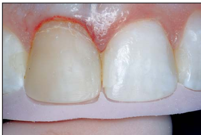
Figure 5. A putty PVS matrix was obtained from a previously waxed-up model in order to aid in the three-dimensional perception of the defect boundaries.

color value. On the other hand, more opacious enamel acts as a barrier that disperses, absorbs, and reflects the light in such a way that a minimal amount of color (ie, hue, chroma) is visualized. This situation determines an enamel of higher value.