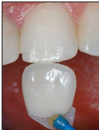
Figure 4. A color mock-up is created to replicate the varying thicknesses, shade, and optical properties of the definitive restoration.