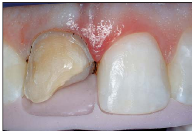
Figure 6. Determination of incisal edge position, embrasure forms, and palatal anatomy is paramount through this approach.

A 33-year-old patient presented with a request for smile improvement (Figures 1 and 2). Clinical examination